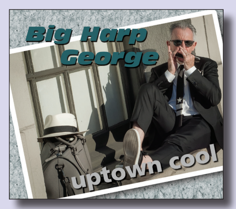
Uptown Cool - 2018

"For its combination of songwriting, musicianship, and its relaxed, unforced approach [Uptown Cool] is clearly one of the strongest blues releases this year." — Jim Hynes, Making a Scene!