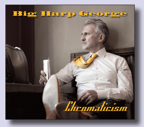
Chromaticism - 2014

"For its combination of songwriting, musicianship, and its relaxed, unforced approach [Uptown Cool] is clearly one of the strongest blues releases this year." — Jim Hynes, Making a Scene!