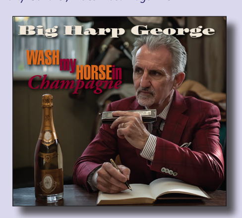
Wash My Horse In Champagne - 2016

"[Big Harp George] remains an absolute master of the chromatic harmonica, blowing brilliantly sculpted, richly melodic solos and obbligatos throughout the 13 tunes that comprise the present disc."